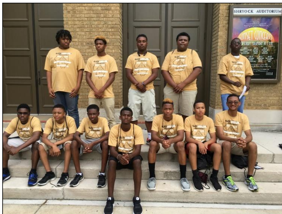
The young men involved in the Alpha Esquire MENTor Program Gamma Lambda has implemented to develop the future generation of leaders.