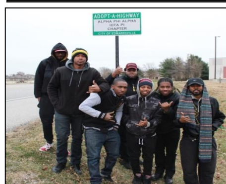
Iota Pi Adopts a Highway in Edwardsville – Pg. 2