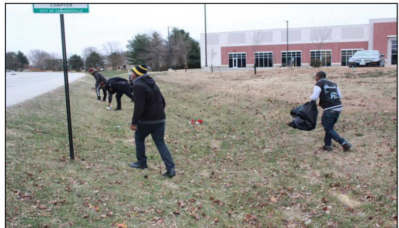
Brothers from Iota Pi chapter, Southern Illinois University in Edwardsville, cleaning their adopted highway located at 91 Fountain Drive in Glen Carbon, IL