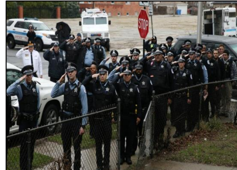
Chicago's Hometown Hero Creating Positive Change – Pg. 4