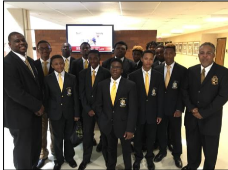
Gamma Lambda Serves as Mentors at SIU Through LDI – Pg. 3